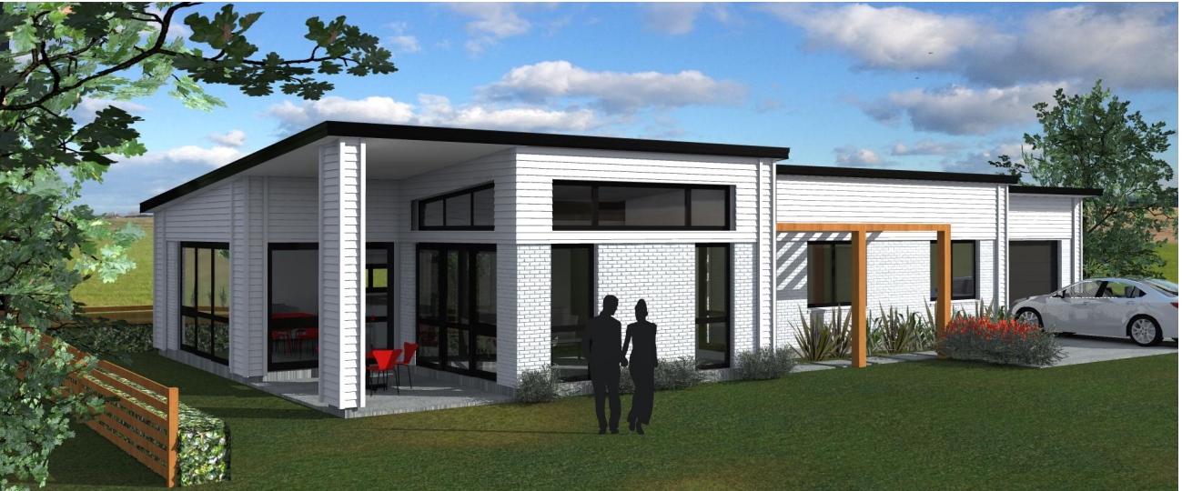
Artist impression only

171m 2 Floor Area Contemporary Style Open Plan Living 3 Bedrooms Alfresco 2.5 Bathrooms Double Garage 419m 2 Land Area